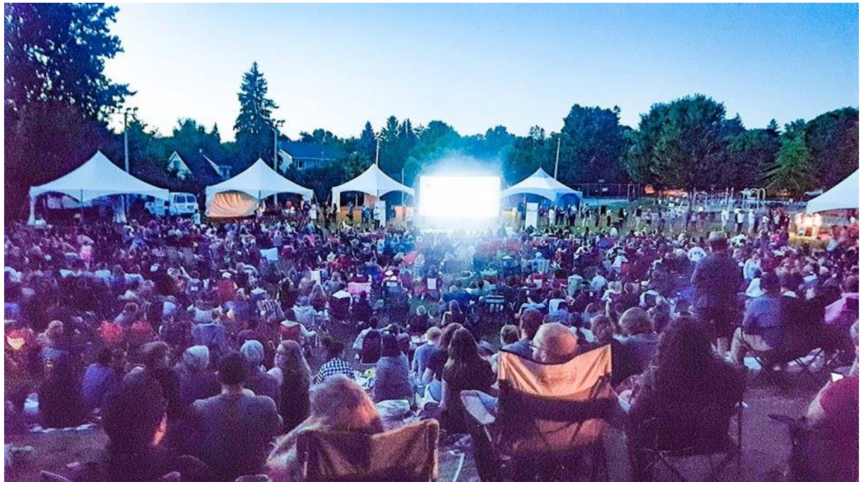
The Princess Bride - Location: DoverCourt Host: Thom Fountain

Which is all set up and manned by our experienced crew.